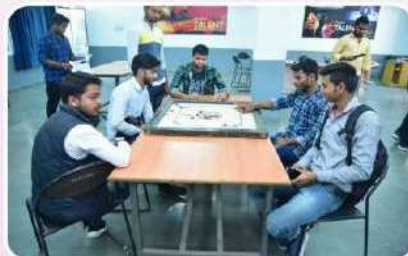
Indoor Game (Carrom)