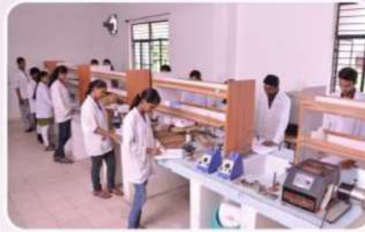
Pharmaceutical Chemistry Lab