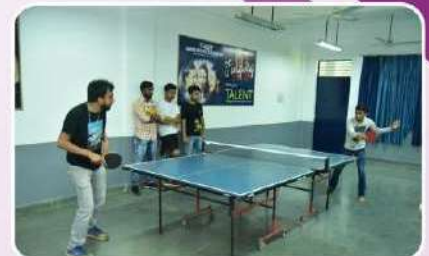
Indoor Game (Table Tennis)