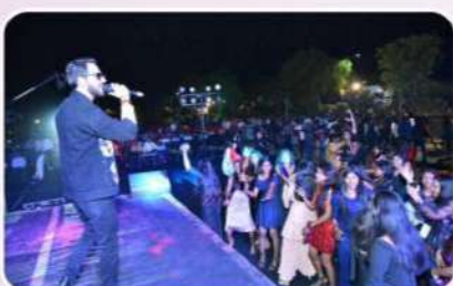
Engenious (Techno-Cultural Fest)