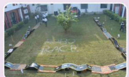
AKTU Zonal Fest