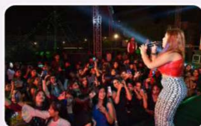
Engenious (Techno-Cultural Fest)