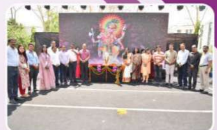
Engenious (Techno-Cultural Fest)