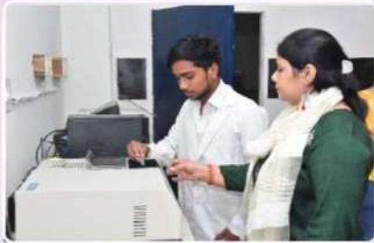
Pharmaceutical Analysis Lab