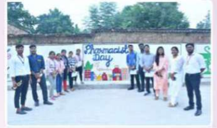
Pharmacist Day Celebration