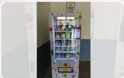
Automatic Vending Machine