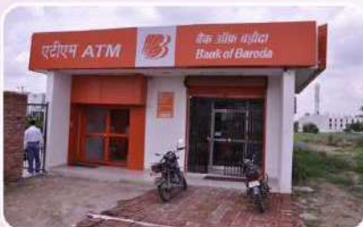
Bank & ATM