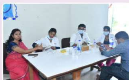
Health Checkup Camp