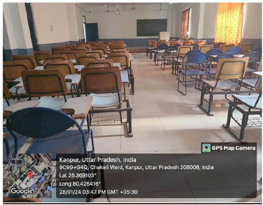
NSH (New Seminar Hall)

A-1, UPSIDC Industrial Area, Rooma, Kanpur-208001 (U.P.) India Ph: 7705011891E-Mail-ID: info.kitp@kit.ac.in, director.kitp@kit.ac.in